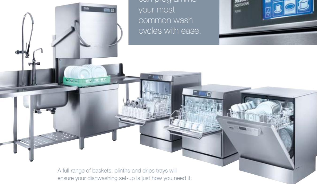
A full range of baskets, plinths and drip trays will ensure your dishwashing set-up is just how you need it.