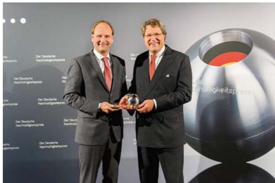
Miele, a family owned company, was awarded the 2014 German Sustainability Prize

All Miele Professional products are certified to ISO 9001, ISO14001, OHSAS 18001 and SA 8000 standards.