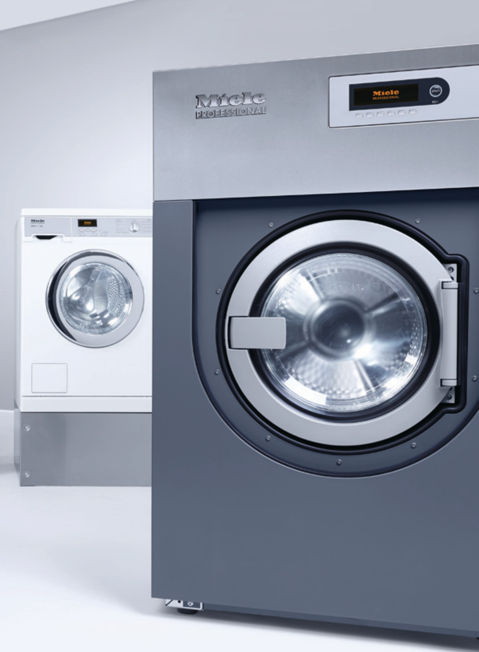
MOPSTAR 60 on UG 5005 plinth, MOPSTAR 130 (left to right)