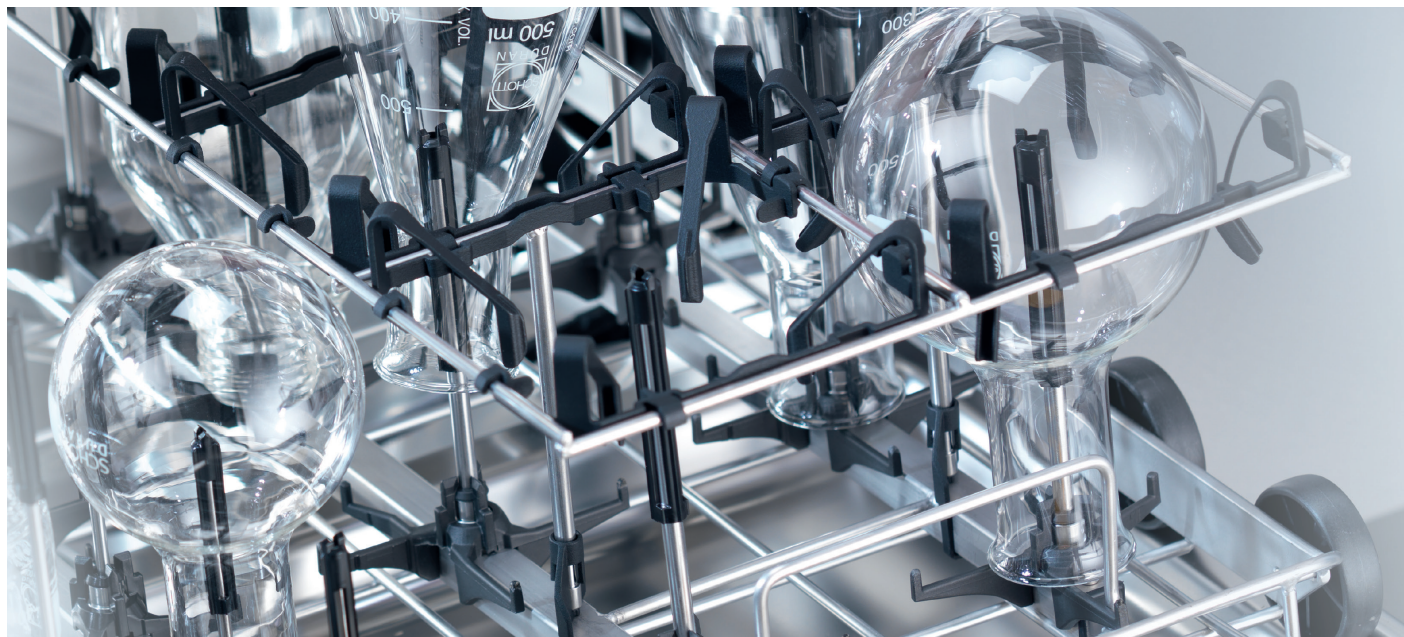
Figure: Load rack with support frame